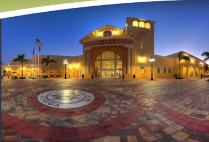
The Treasure Coast's Ultimate Holiday Mixer will be held at the new Port St. Lucie Civic Center Tuesday, December 9th from 4-7 p.m.

Schreiber Center, IRSC Campus, St. Lucie West