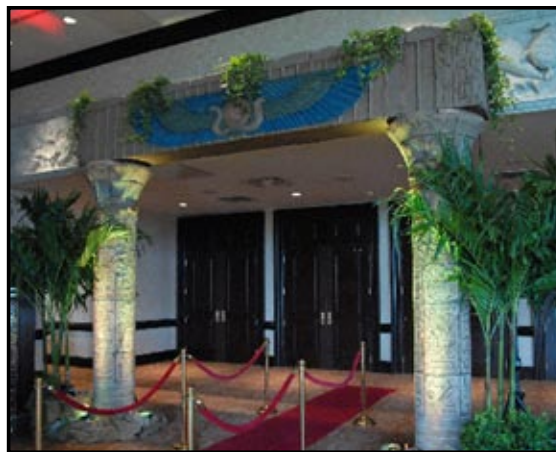
The Golden Image Awards are always "dress to impress" and the décor is amazing. This year's pyramid theme was very Egyptian with shifting "sands" of light and quite magical.