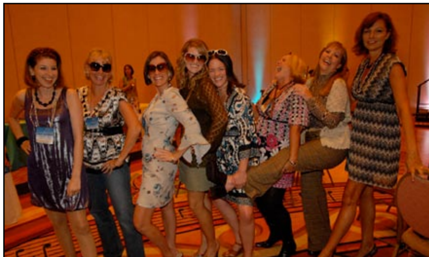
This year's scholarship function was a 70's celebration and we all dressed up and boogied down. There were also silent and live auctions and a trivia contest.