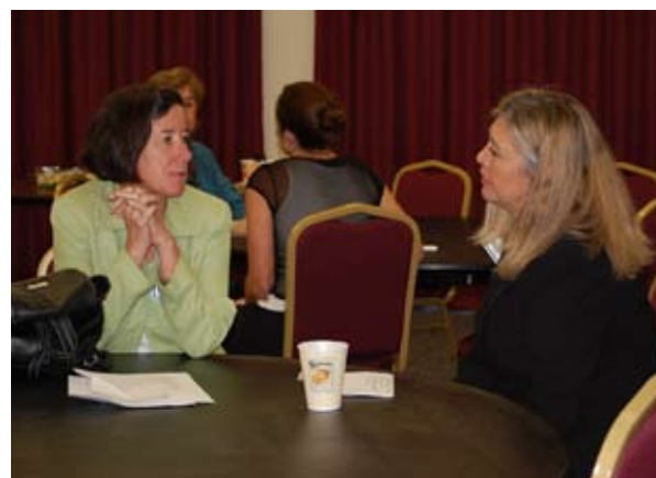
The February "Speed Networking" meeting was an overwhelming success with many happy, smiling people breaking the "network for 5-minutes only" rule!