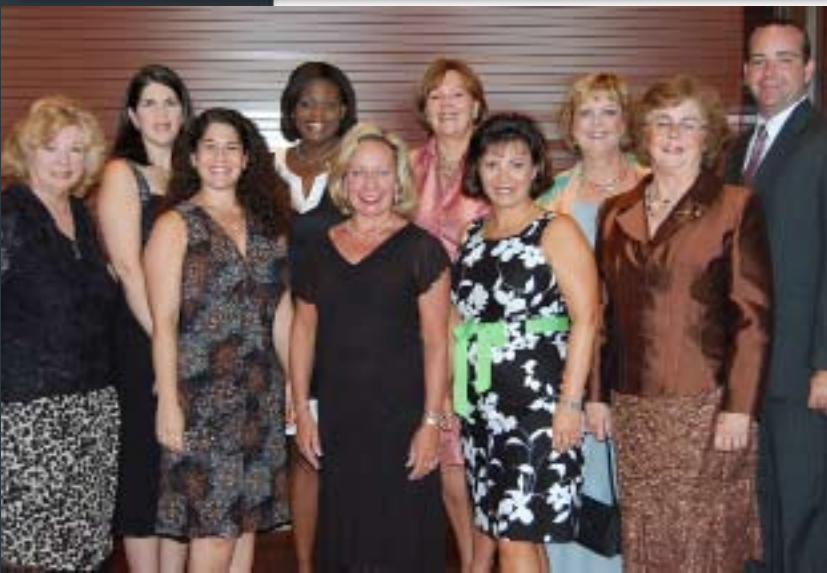
TOP: 2007 Indian River Council social. BOTTOM: 2008 Annual Conference in Orlando.