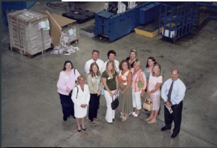
TOP: 2005 Annual Conference in Amelia Island. BOTTOM: 2006 Tour of Scripps Treasure Coast Newspapers' printing facility